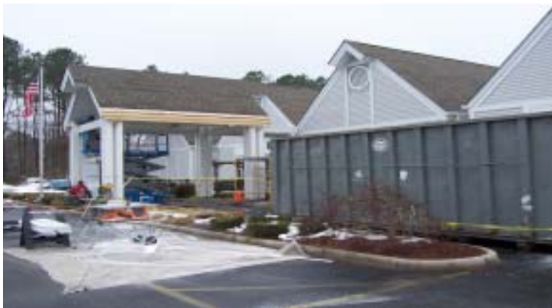
A donation from Camp Foundations has made it possible for the Children's Center to renovate the canopy in front of the Texie Camp Marks building in Franklin. The canopy had structural damage because of rainwater sitting on top of the flat roof.

The Children's Center is a private, non-profit organization. Donations are tax deductible.