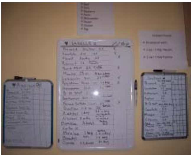
The Diefenbacher’s follow this routine everyday for their children.